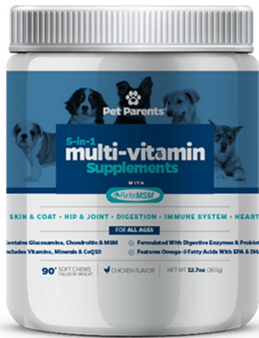
Multi-vitamins (with digestive enzymes, probiotics, vitamins, and minerals)

When your customer's fur-baby is dealing with certain health issues, there are many different approaches they can take in helping alleviate, improve, and prevent the symptoms. Supplements play a vital role in doing all three! They can help manage the accompanying symptoms of those issues - like loss of appetite, restlessness, hypertension, upset stomach, bladder and gastrointestinal disorders, the list goes on. They provide your customers' fur-babies with the right and sufficient amount of nutrients to benefit their health. These are a great complementary product for those customers who are purchasing our pee pads because of health issues that result in urinary and fecal messes.