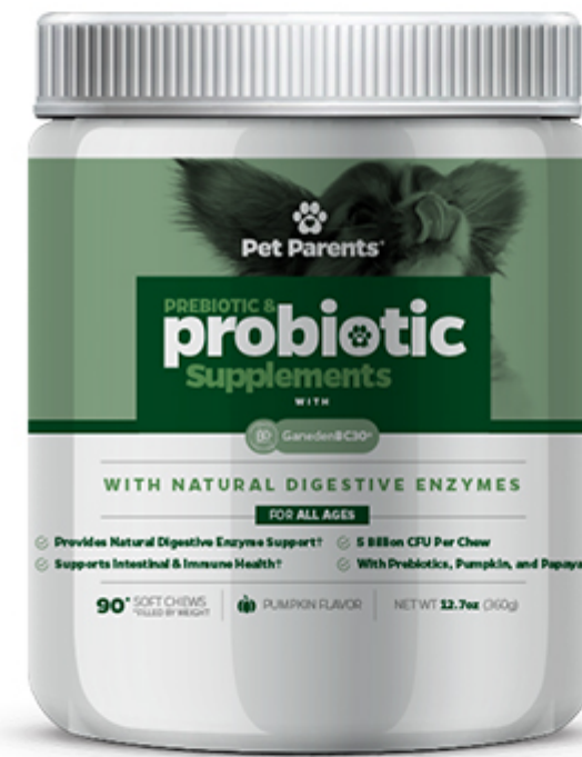
Probiotics (with digestive enzymes)