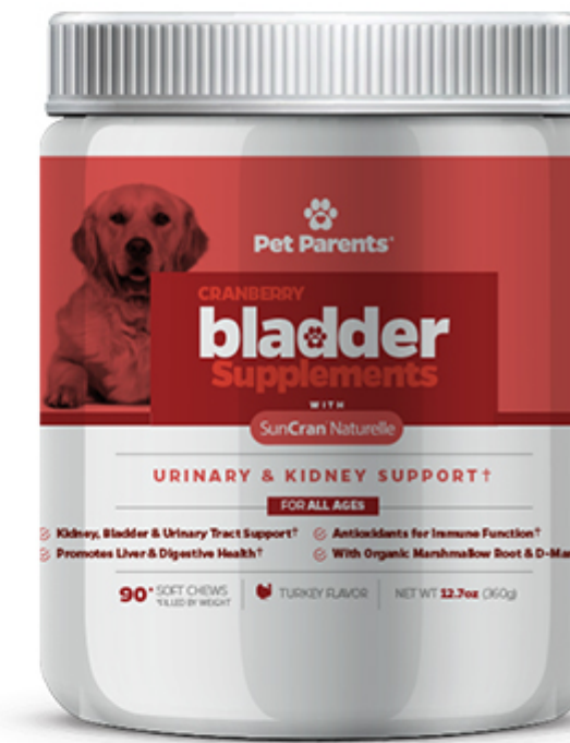
Bladder (with cranberry and pumpkin seed extract)