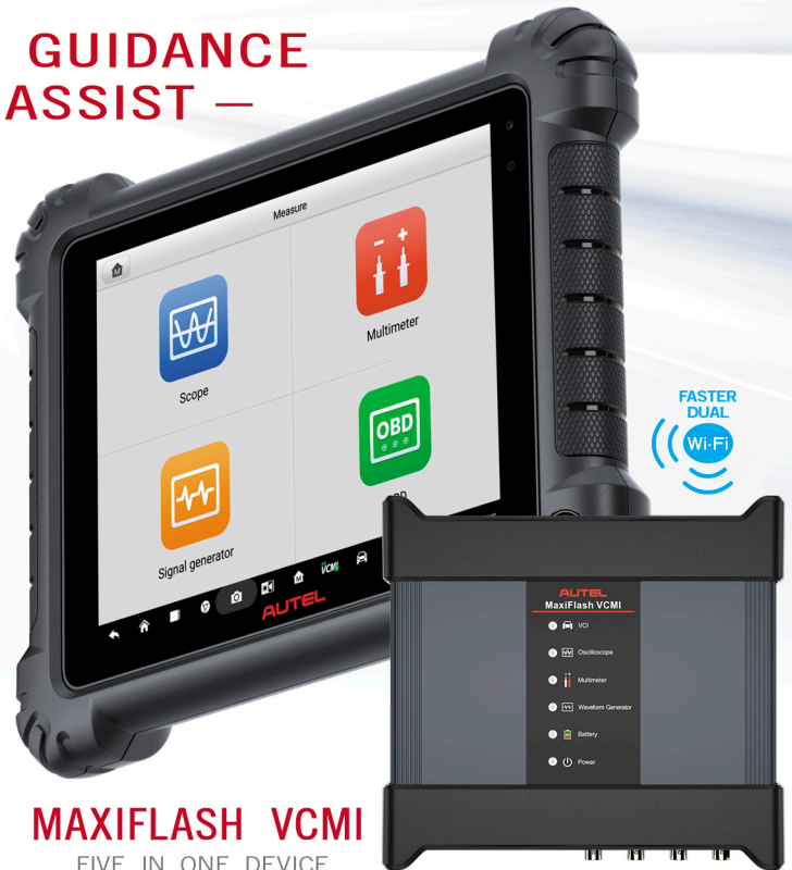
MAXIFLASH VCI FIVE IN ONE DEVICE