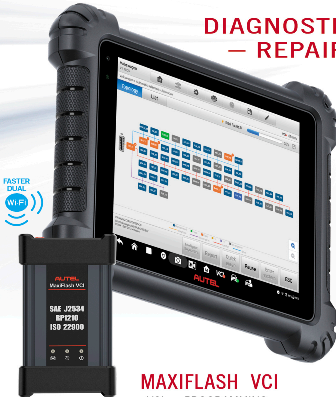
MAXIFLASH VCI VCI + PROGRAMMING