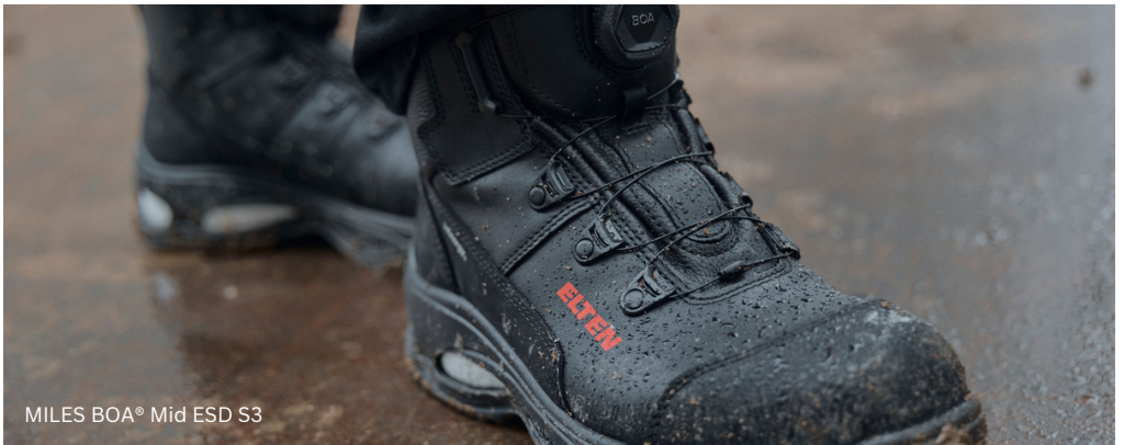
MILES BOA® Mid ESD S3

Waterproof and Breathable Coming soon in 2023!