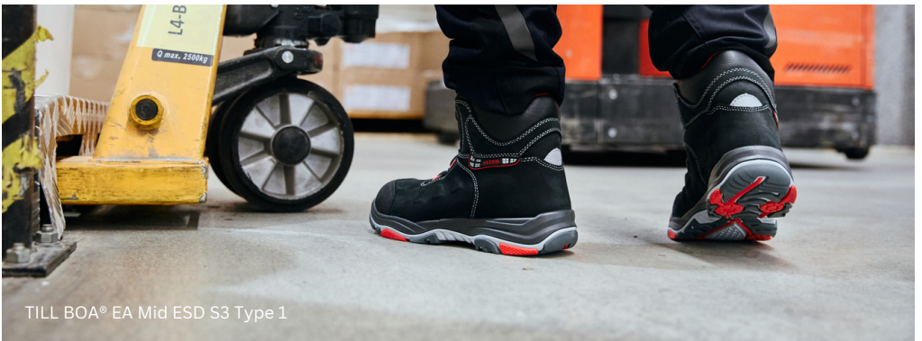
TILL BOA® EA Mid ESD S3 Type 1

Exclusively available at www.stitchkraft.com.au