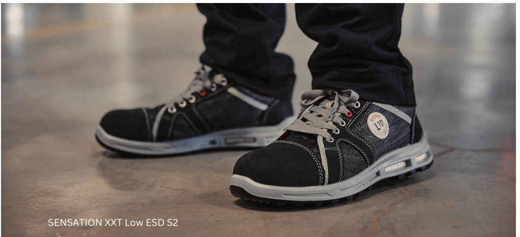
SENSATION XXT Low ESD S2

Exclusively available at www.stitchkraft.com.au