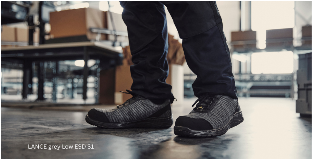
LANCE grey Low ESD S1

Exclusively available at www.stitchkraft.com.au