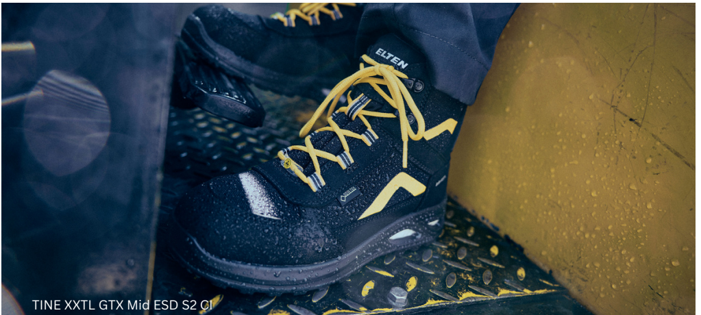
TINE XXTL GTX Mid ESD S2 CI

Exclusively available at www.stitchkraft.com.au