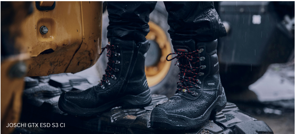
JOSCHI GTX ESD S3 CI

Exclusively available at www.stitchkraft.com.au