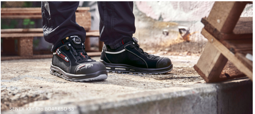
SENEX XXT Pro BOA® ESD S3

Exclusively available at www.stitchkraft.com.au