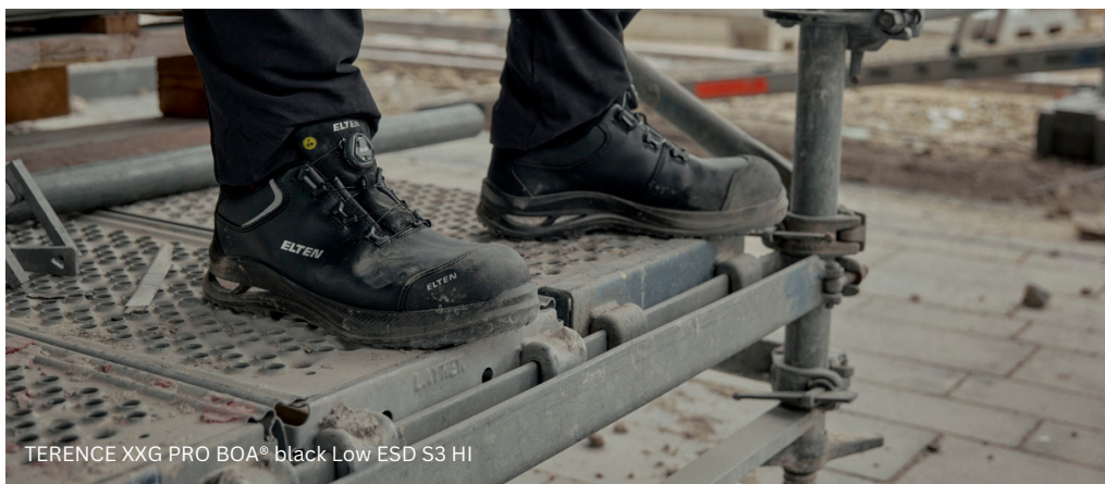
TERENCE XXG PRO BOA® black Low ESD S3 HI

Exclusively available at www.stitchkraft.com.au