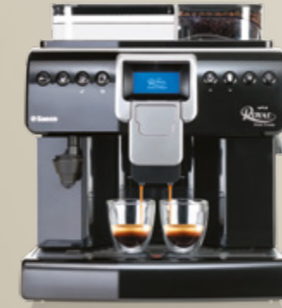
Royal Gran Crema

Cup warmer Pre-ground coffee option Steel conical blades