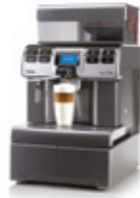
Aulika Top / Top RI High Speed Cappuccino