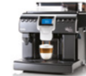
Royal Gran Crema

*Supplied separately; installed by the operator