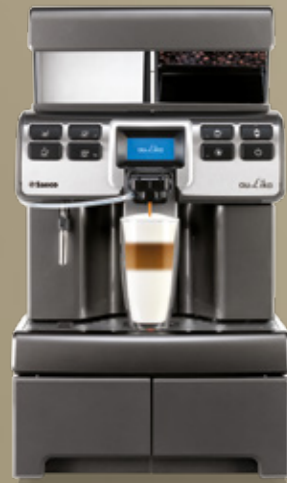
Aulika Top / Top RI High Speed Cappuccino