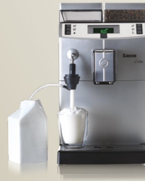
Lirika Tuono Cappuccinatore

Tuono cappuccinatore to be mounted on the steam wand for the frothing of creamy cappuccinos and milk drinks.