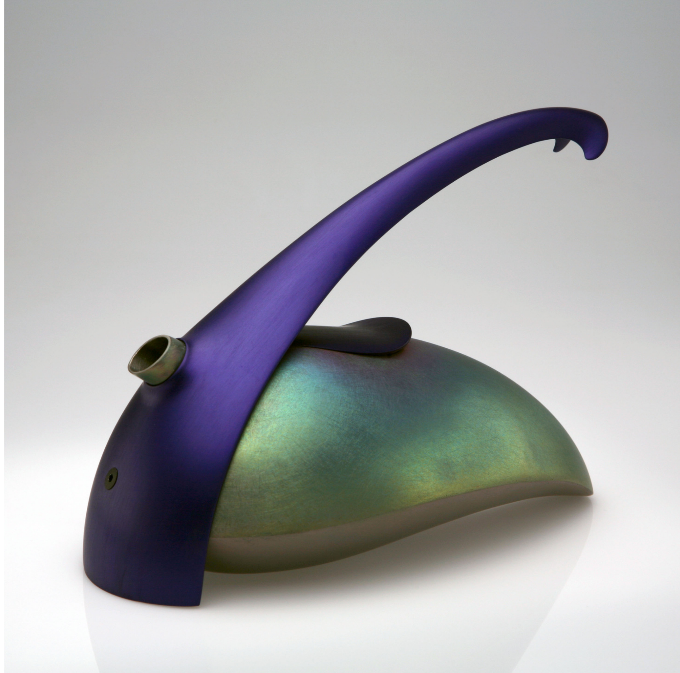
Image: Robert Foster, Chrissy Bettle, 2008.

Front Cover: Robert Foster, Kimono Pendant.