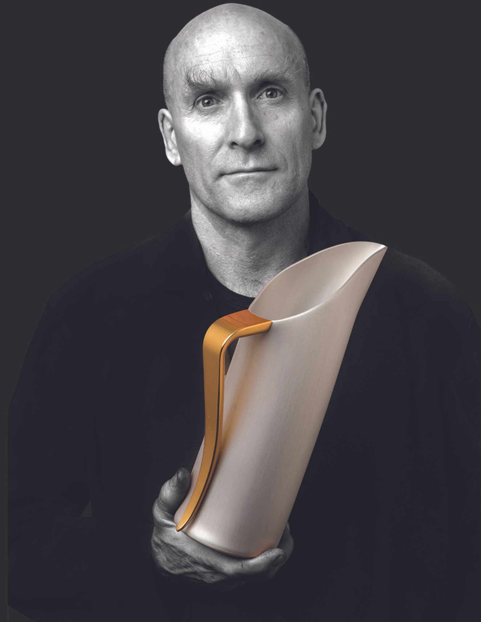
Image: Luminary exhibition poster, designed by Lou Scrivener.

CEO + Artistic Director, Craft ACT: Craft + Design jodie.cunningham@craftact.org.au or 02 6262 9333