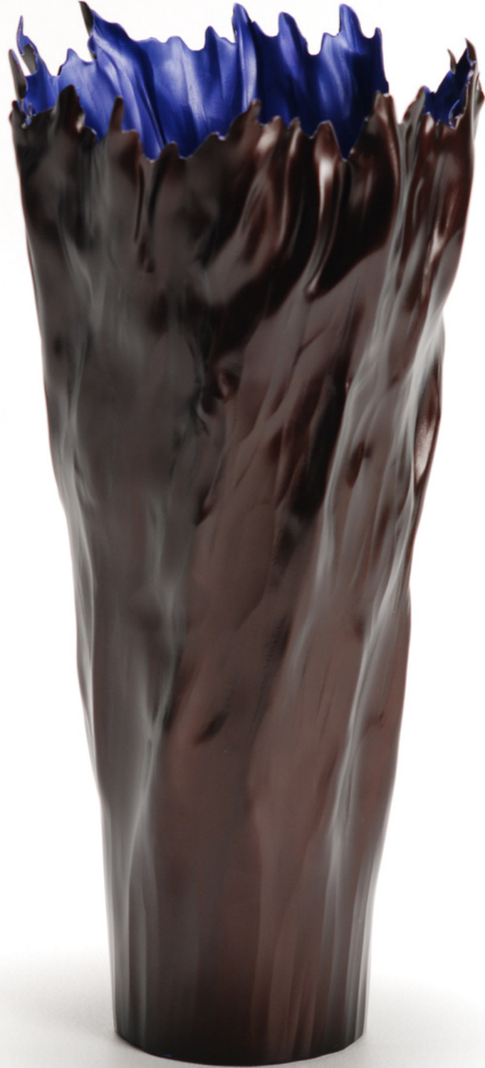
Image: Robert Foster, Captured Azure.

The opportunity is open to emerging and established Australian designers, designer/makers, and craftspeople. The submissions can be for proposed or completed work from the last 12 months. Incomplete and late applications will not be accepted. Staff and relatives related to the sponsors, the Tall Foundation and F!NK + Co., are not permitted to apply.