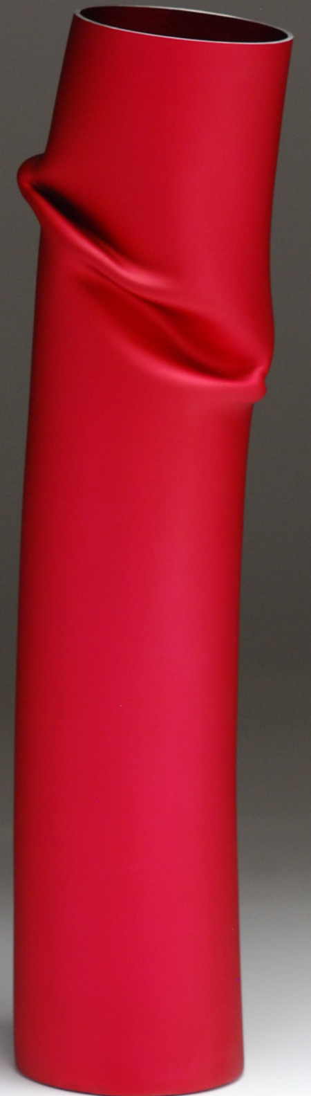
Image: Robert Foster, Zen Thrust, 2015.