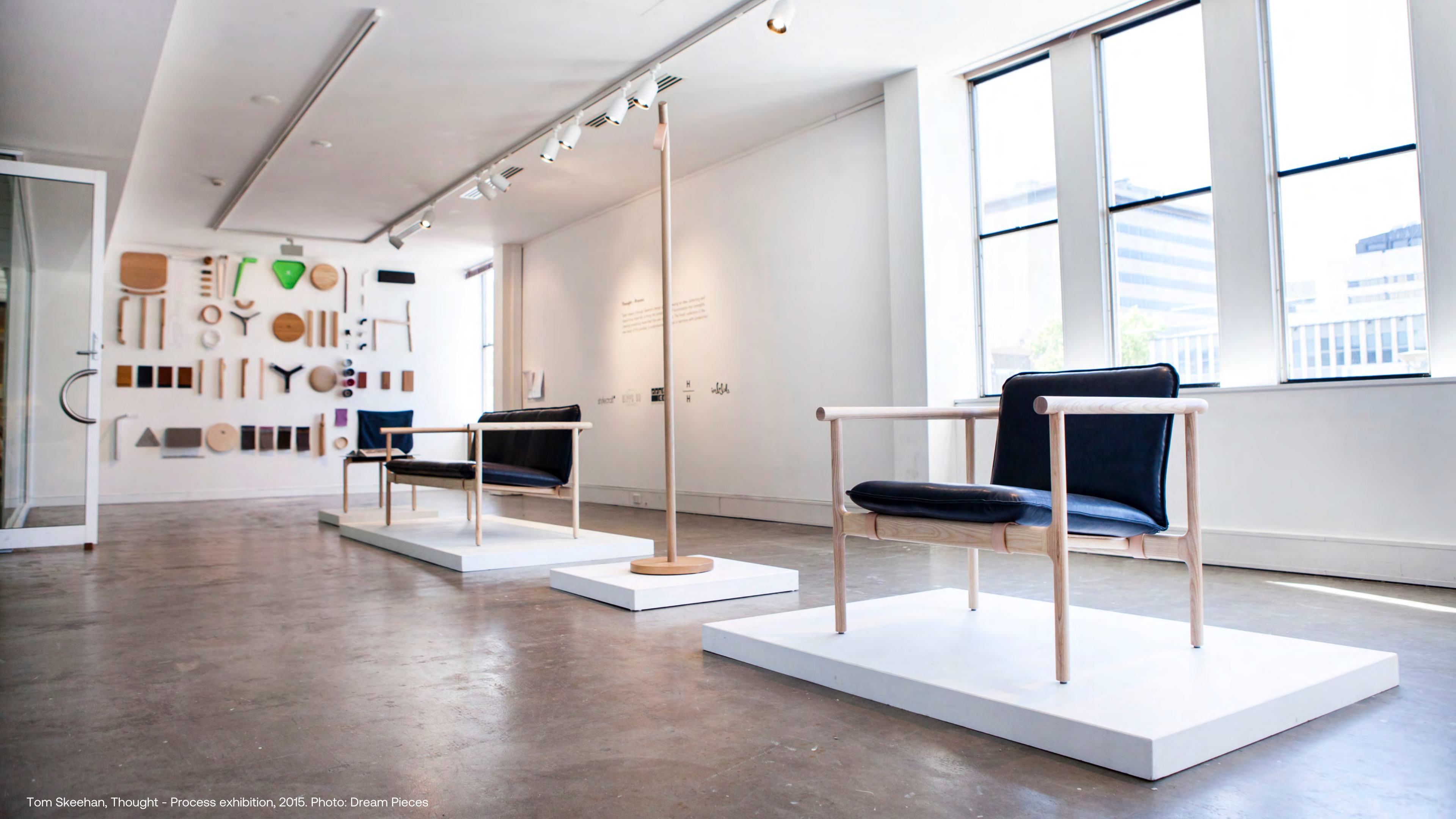
Tom Skeeahan, Thought - Process exhibition, 2015.