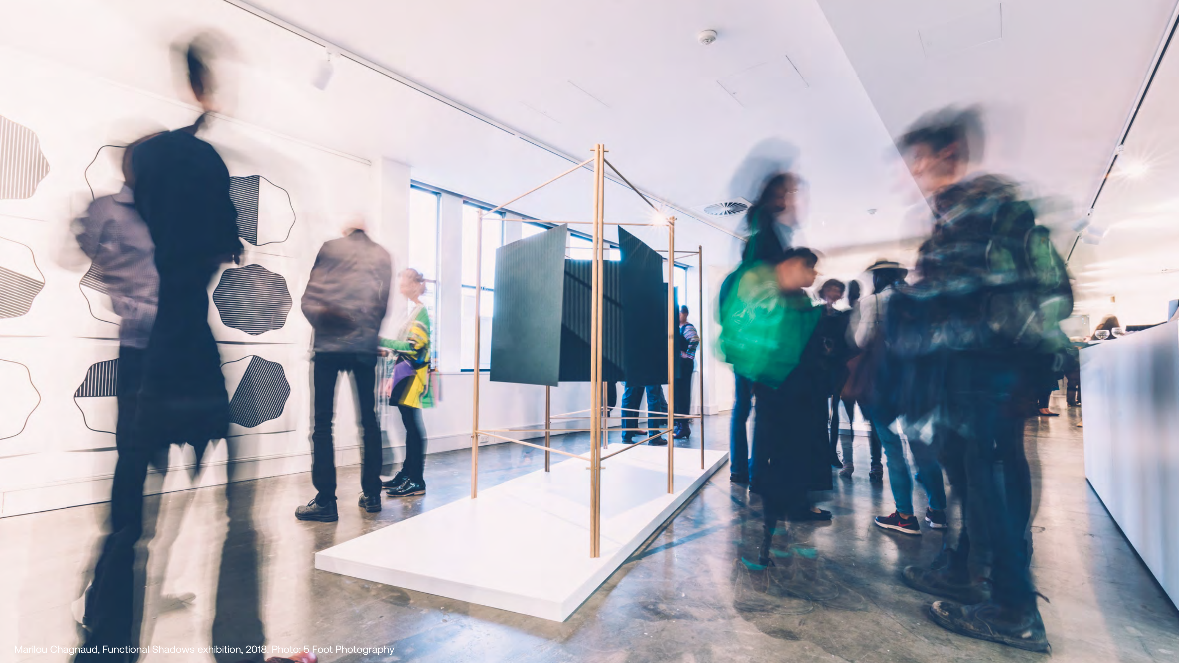
Marilou Chagnaud, Functional Shadows exhibition, 2018.