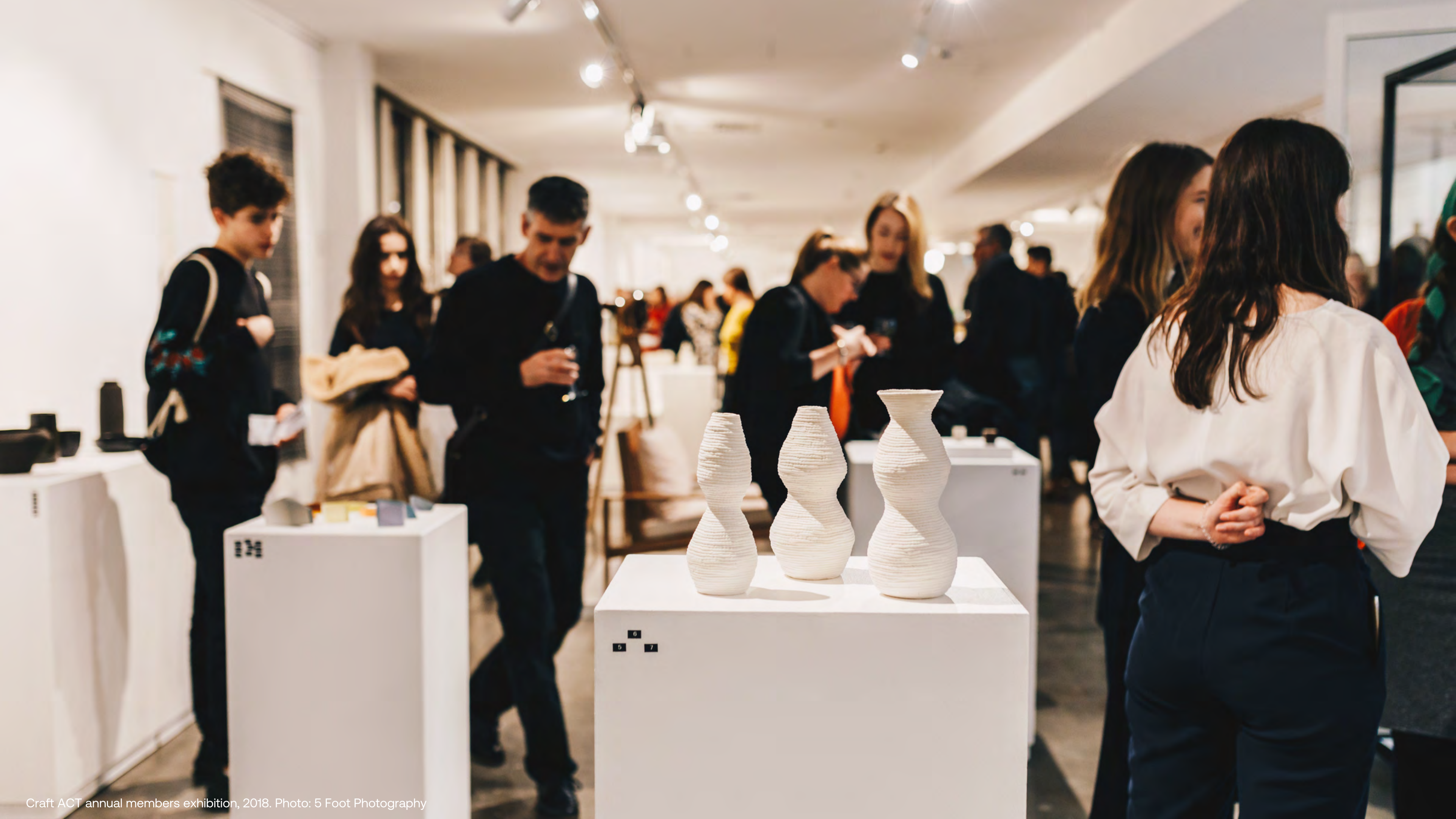
Craft ACT annual members exhibition, 2018.