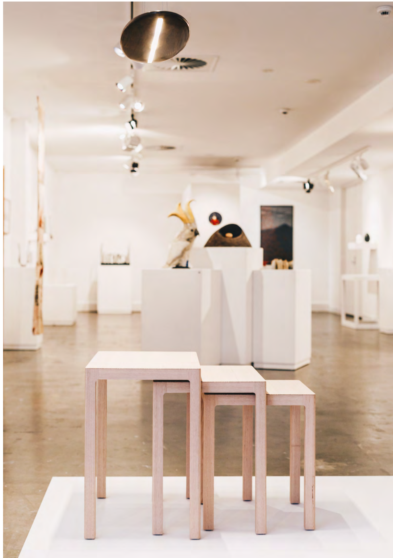
Craft ACT annual members exhibition, 2018.