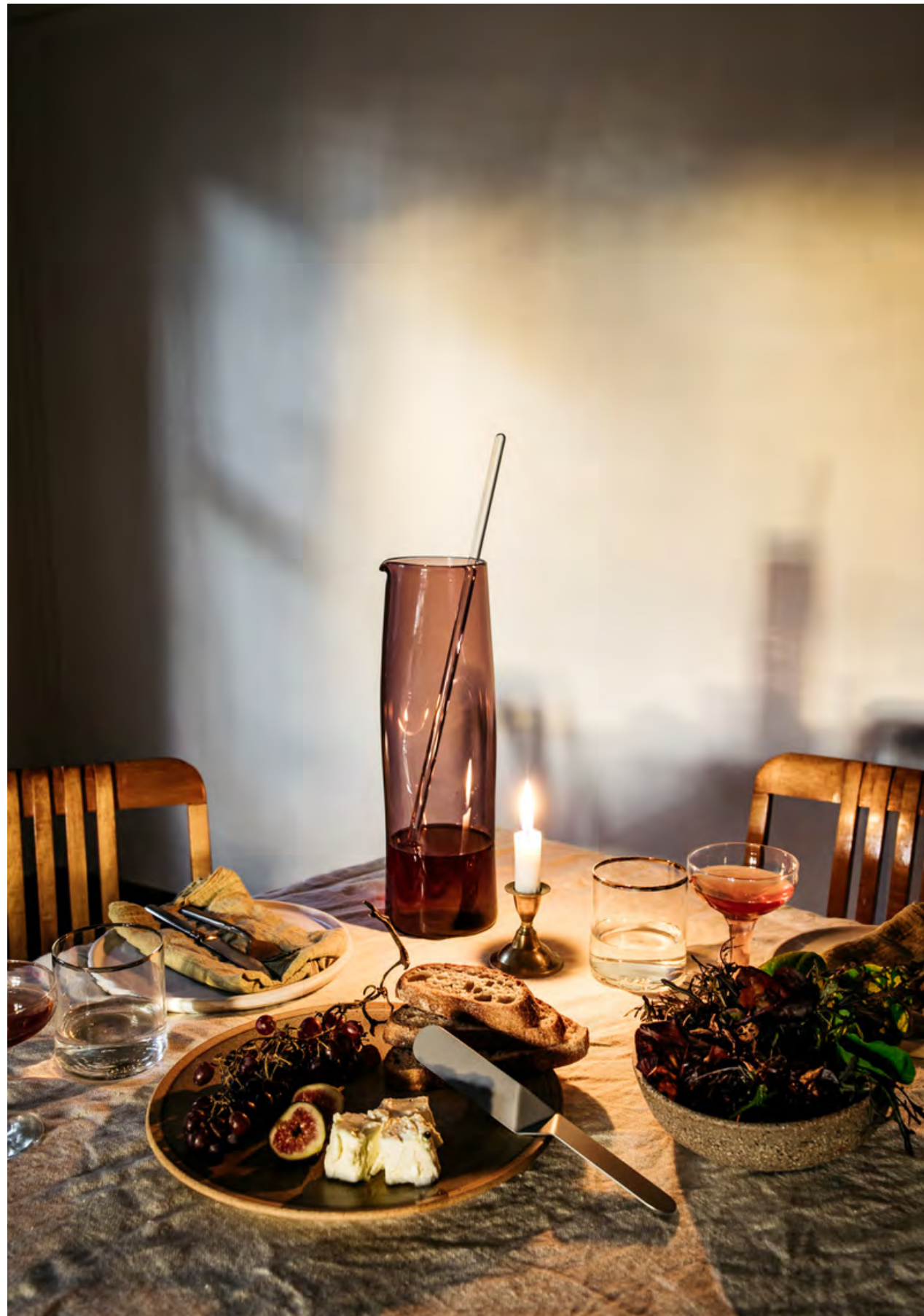
Craft ACT retail stockists.