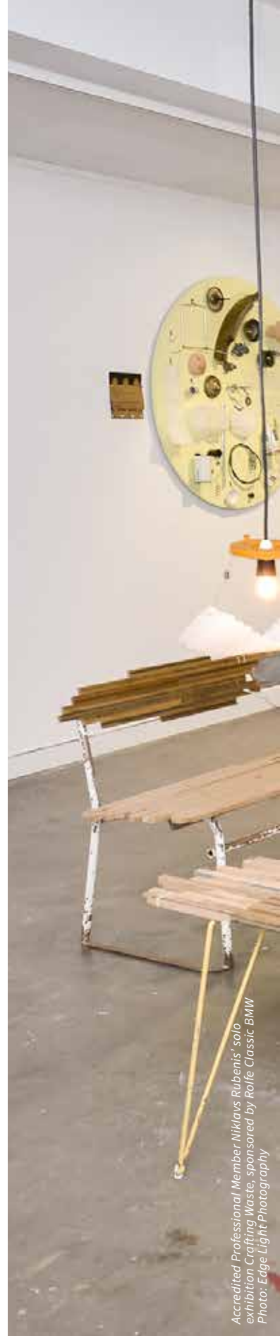
Accredited Professional Member Niklavs Rubenis' solo exhibition 'Crafting Waste', sponsored by Rolfe Classic BMW