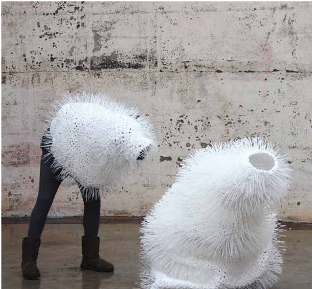
Tundi-Rose Hammond, 'Olaf' the XL coil creature 2015, cable ties, packing foam and digital media.