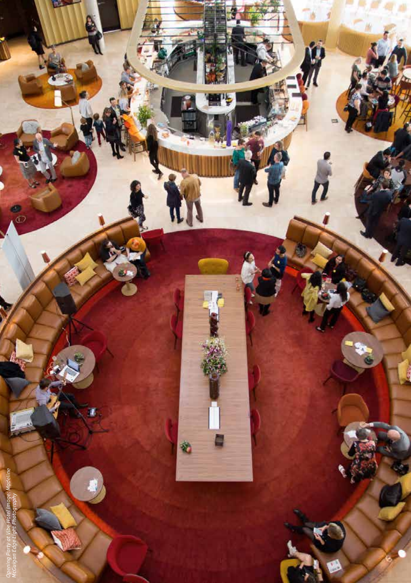
Opening Party at Vibe Hotel