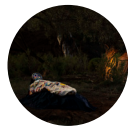
10 Kasia Tons + Dave Laslett Untitled 1 , 2020 Photographic print on Canson platine fibre rag $560