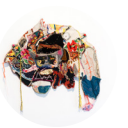
4 She is the Spirit of the doorway leading out , 2017-18 hand embroidery, applique, beading, assorted reclaimed materials $1,680