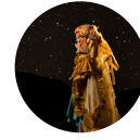
11 Kasia Tons + Dave Laslett Untitled 2 , 2020 Photographic print on Canson platine fibre rag $365