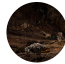
14 Kasia Tons + Dave Laslett Untitled 4 , 2020 Photographic print on Canson platine fibre rag $620