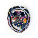
5 The heavy mask , 2019-20 felt, needle felting, hand embroidery, pebbles $840