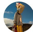
13 Kasia Tons + Dave Laslett Untitled 3 , 2020 Photographic print on Canson platine fibre rag $365