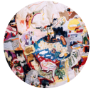
1 After , 2019-20 hand embroidery, wool, cotton, canvas base $24,000