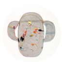
2 Screentime mask 1 , 2020 hand embroidery, fly screen base $1,120