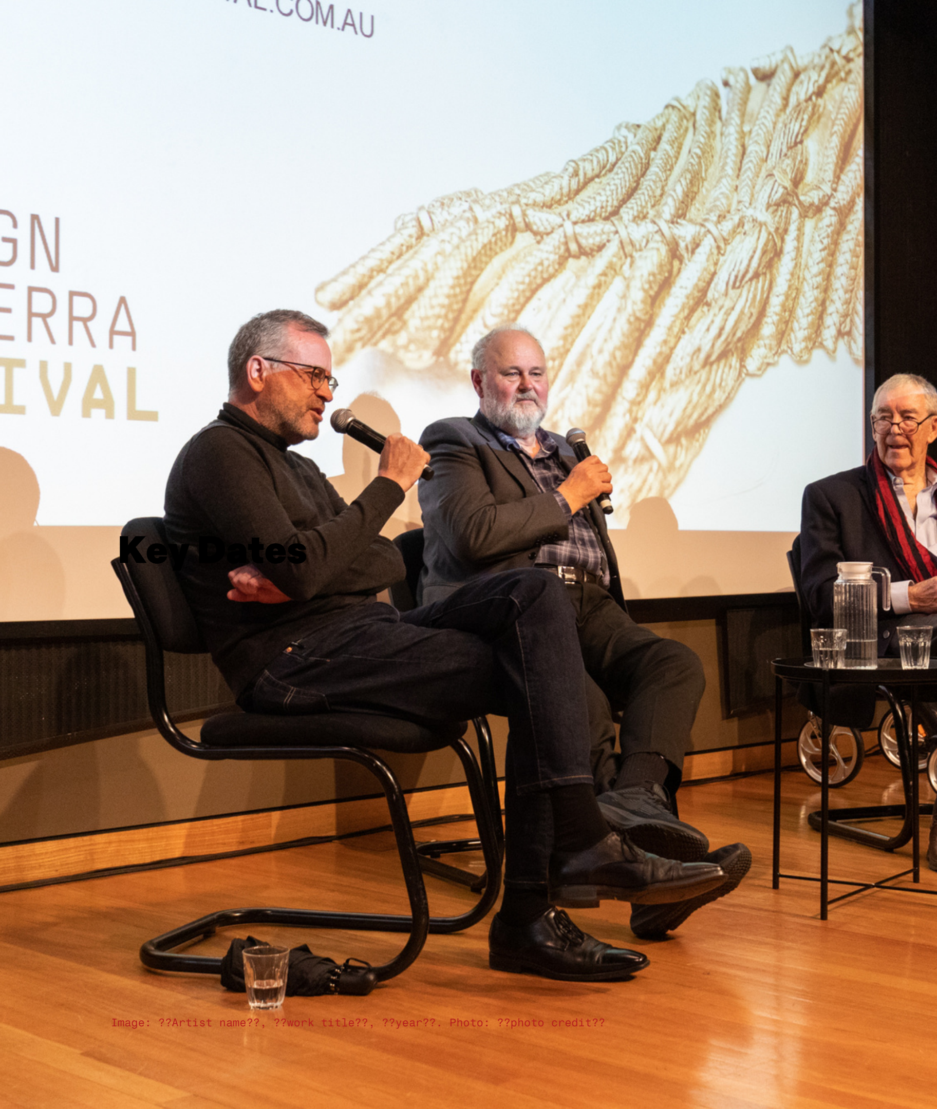
Image: ??Artist name??, ??work title??, ??year??. Photo: ??photo credit??