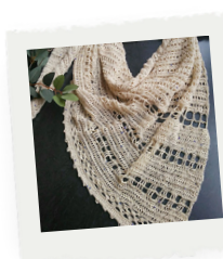
Lovelace Shawl Crochet Pattern