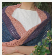
Sunset on the Water Crochet Pattern