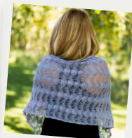
Silk Waves Shawl Crochet Pattern

Check out more patterns at www.darngoodyarn.com