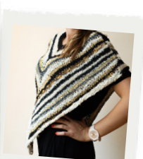
Prato Striped Poncho Knitting Pattern

Check out more patterns at www.darngoodyarn.com