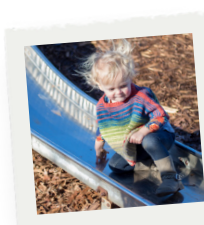
Herbal Dyed Silk Toddler Poncho Crochet Pattern