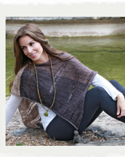
Drop it Like its Hot Poncho Knitting Pattern