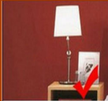
1. Brush paint