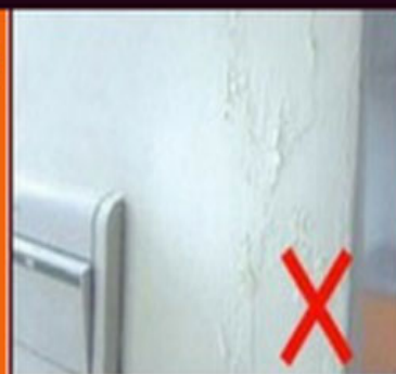
1. Drop ash