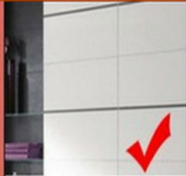
2. Ceramic tile