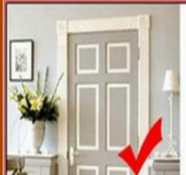
4. Metal surface