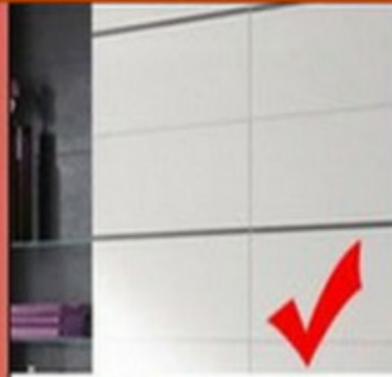
2. Ceramic tile