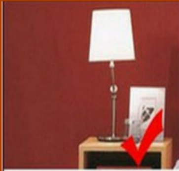
1. Brush paint