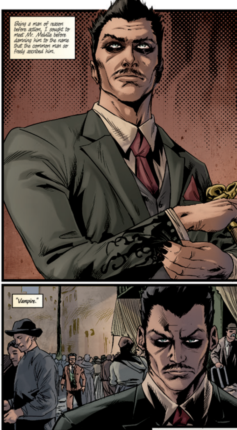
The undertelly of New York, and all of this continent, it seems, sizeles with the red host wrath of the undead. They are more widespread than ever, living as men and diving as kings on those footkandy enough to thust them.

They no longer hide. They seem to have lost their fear of humanity.