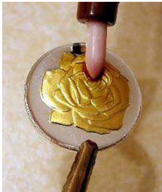
Sidekick Warranty Revised 07/22

Warning: The individual user should take care to determine prior to use whether this device is suitable, adequate and safe for the use intended. Since individual applications are subject to great variation, the manufacturer makes no representation or warranty as to the suitability or fitness of this equipment for any specific application except as explicitly described in the written material provided by Gold Plating Services Inc.