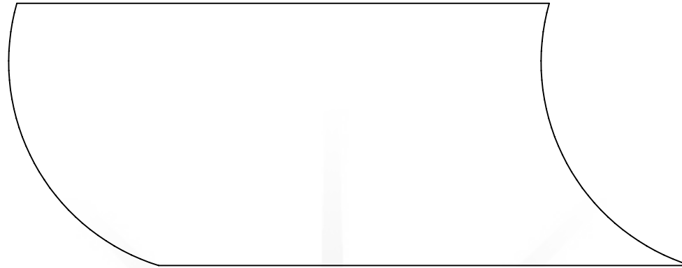
REPRESENTATION OF FINISHED PRODUCTS NOT TO SCALE