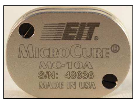
MicroCure showing range (10 Watts) and band (UVA)