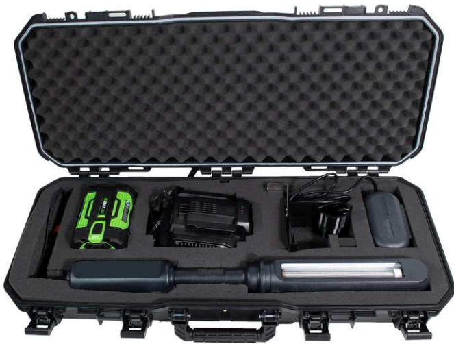
EGO Battery, Charger, DC Adapter and case sold separately