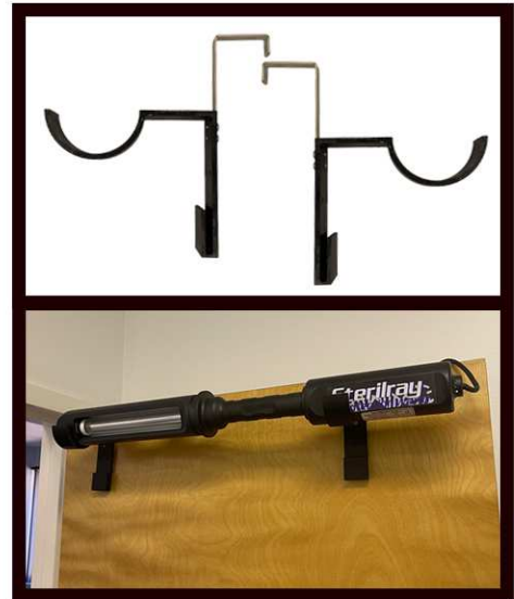
Door or Wall Brackets Can be configured with hooks for over doors, dividers, or mounted to a wall for a permanent solution.