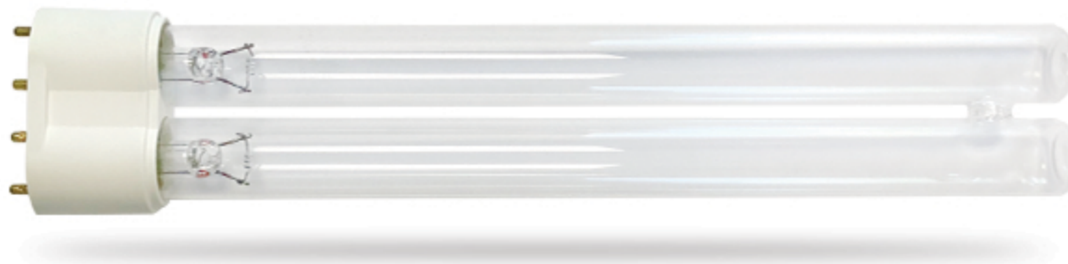
Lamp Type: TUV-PL-L55W