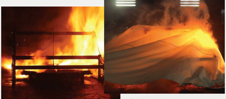
Full scale EV module tests conducted early 2024

Built for peace of mind, our products will help you isolate the threat, so you can protect the people and property you are meant to keep safe.