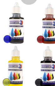
Cyan, Magenta, Yellow & Black (4 x 30ml Dispenser Bottles)