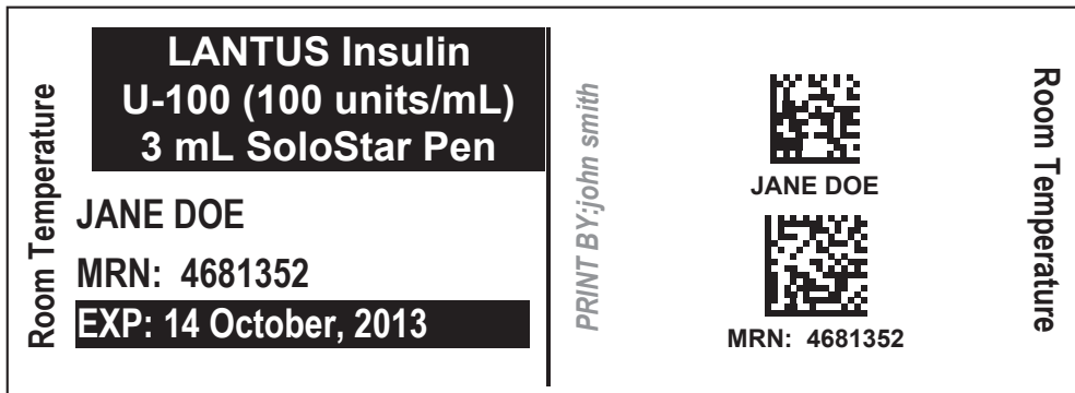
The label generated by RxTOOLKIT includes expiration information and a barcode representing the patient name and/or Medical RN for positive ID of pen ownership. Product information can be retrieved by scanning the product QR code with a smartphone.