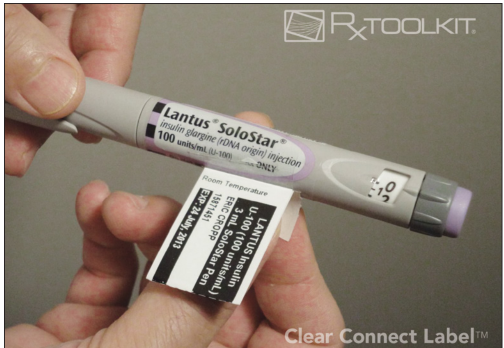
The label format and adhesive sleeve are designed to display all the information required to safely dispense and use the insulin pen without obscuring the manufacturer label.

use of all upper case letters for the patient, all lower case letters for the dispensing pharmacist, and two forms of patient ID.