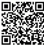
Scan QR code to see our How-to Foam Video

⚠WARNING: This product can expose you to chemicals including 2,2'-Iminodiethanol, which are known to the State of California to cause cancer and birth defects or other reproductive harm. For more information, go to www.P65Warnings.ca.gov .