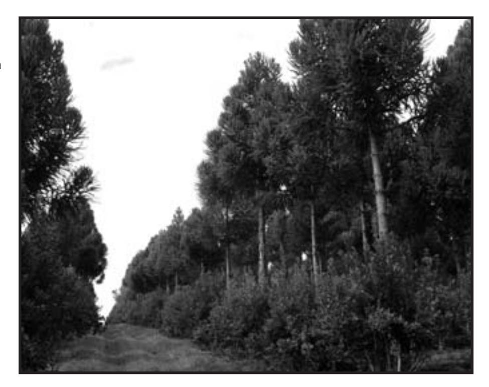
Figure 2. Yerba Mate intercropped with araucaria in Misiones.

Intercropping yerba mate with araucaria or other native species can provide increased soil organic matter and nutrient cycling, pest and weed control, and heightened levels of secondary com-