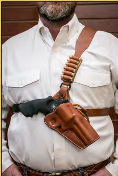
*pictured with reload accessory*