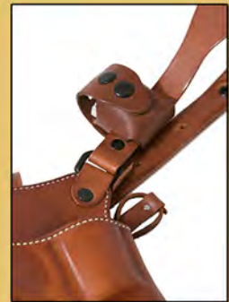
Guide's Choice™ Speed Loader Pouch MSRP - $50.00