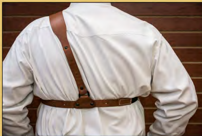
Guide's Choice™ Chest Holster