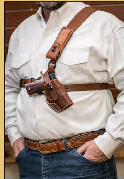
*pictured with mag. pouch accessory*