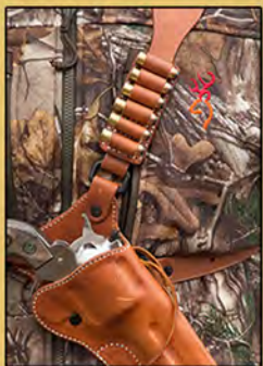
Guide's Choice™ Reload MSRP - $35.00