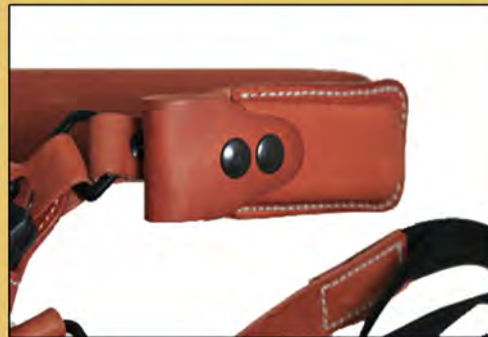
Guide's Choice™ Mag Pouch MSRP - $55.00