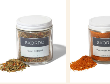
Vietnamese Pork Rub