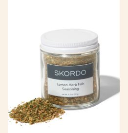
Lemon Herb Fish Seasoning

Kraft box set with label that lists set title and set contents. All sets include four 1/4 cup jars. Each 1/4 cup jar has a label on the back with ingredients, flavor notes, and suggested uses.