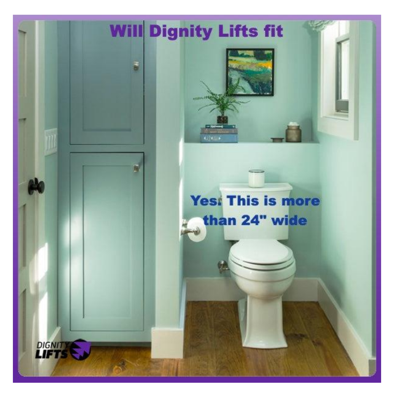
Even green bathrooms can fit a toilet lift.