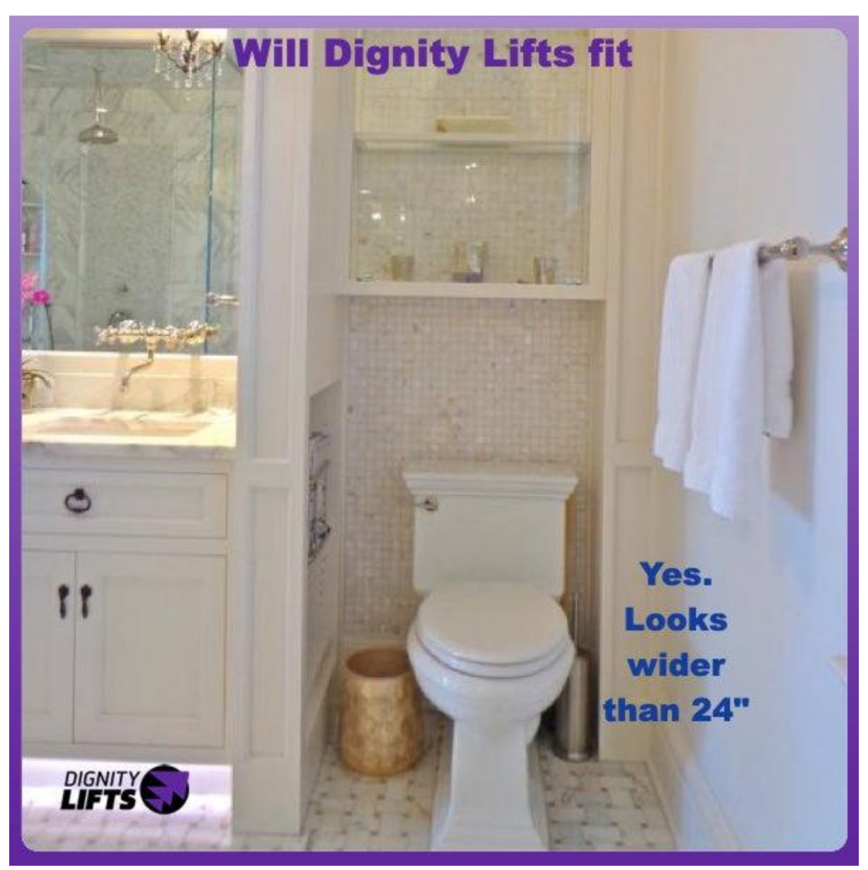
Like most modern bathrooms, this one has plenty of space for Dignity Lifts.