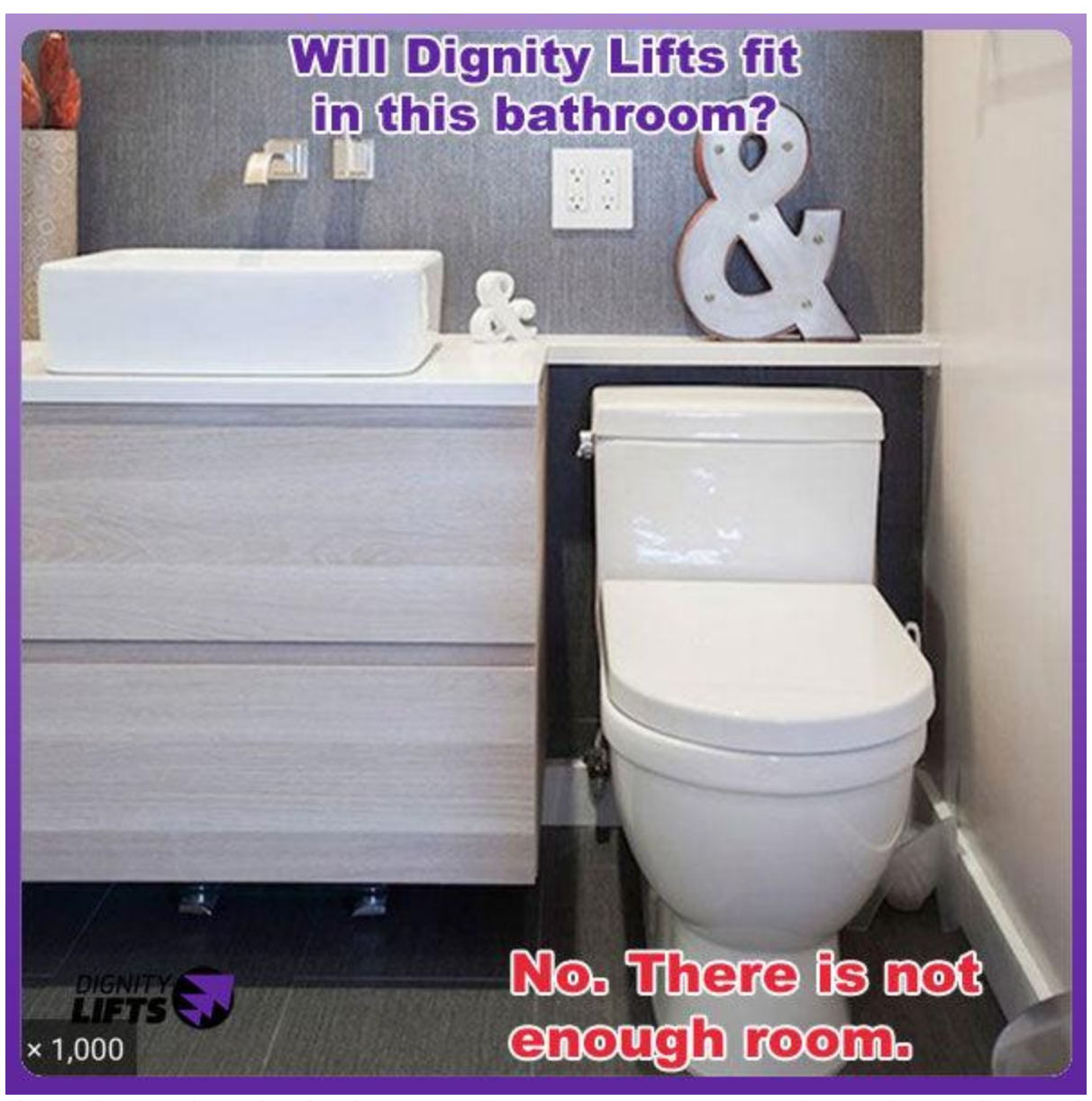
The toilet nook in this bathroom is far too narrow to put a lift in there. The nook needs to be at least 24" wide.