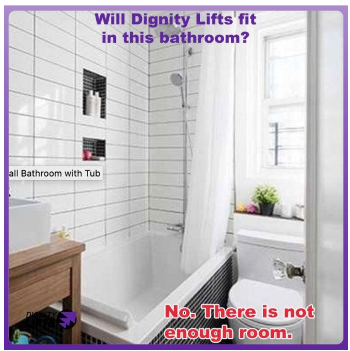
This toilet is too close to the bath tub to fit a toilet lift. A toilet lift won't fit in that narrow space.