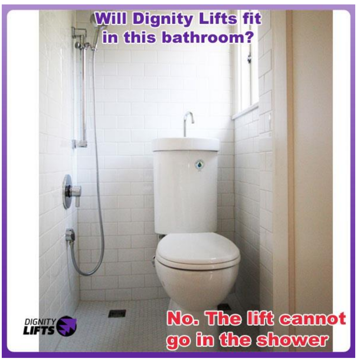
This bathroom is so small that the entire thing is inside the shower. Our lift cannot be doused with water, so this will not work.