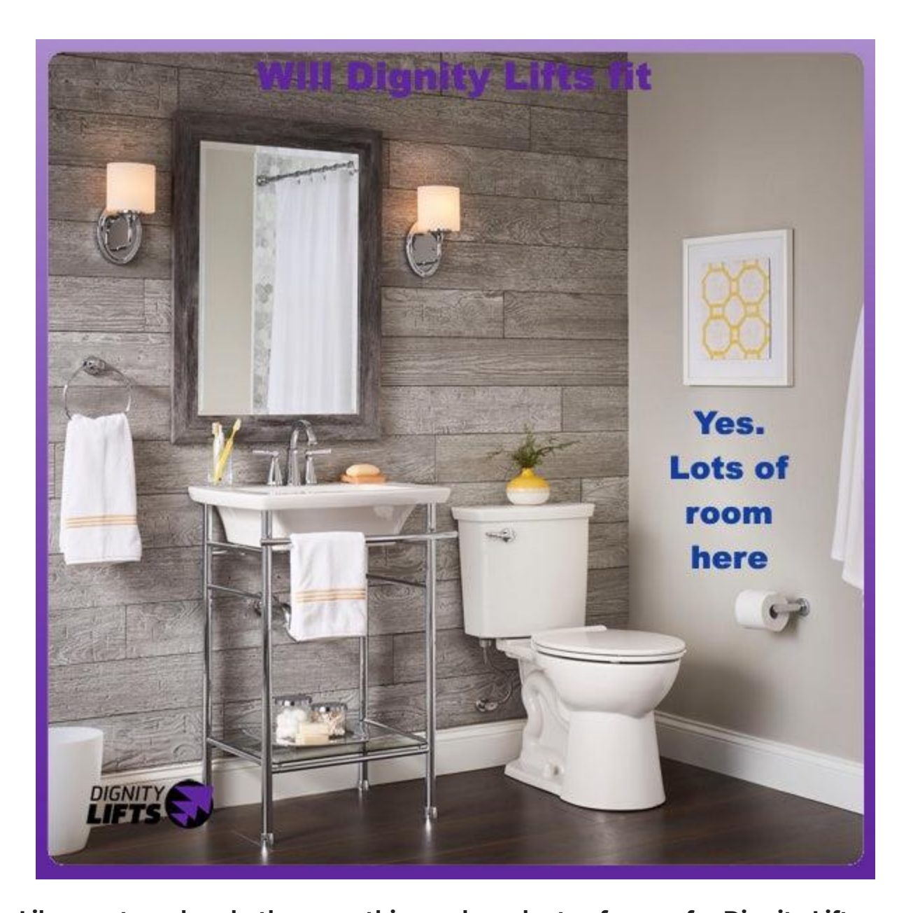
Like most modern bathrooms, this one has plenty of space for Dignity Lifts.