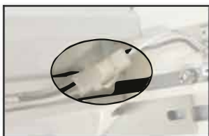
Power Connector, only on one of the Corner Pieces.

Join the power connector on the base with the connector on the one Corner Piece (3).