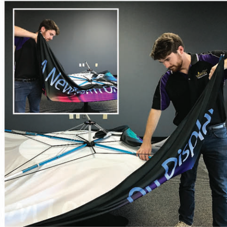
Unfold remaining arms locking the sliders