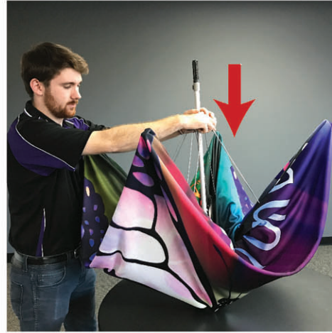
Unfold unit by pushing hub toward table