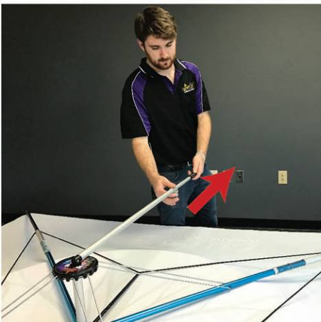
Extend the telescoping leg