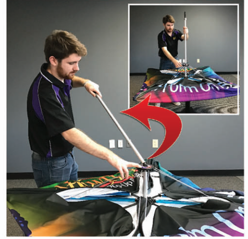
Pivot telescoping leg 90° to lock hub.