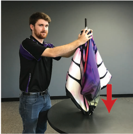
Set ShowFlex upright on table