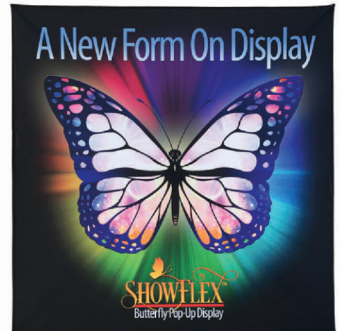
Ready to show! Patent Pending

IMPORTANT: Pivot telescoping leg 90 degrees to lock the hub in place BEFORE unfolding the arms of the ShowFlex.