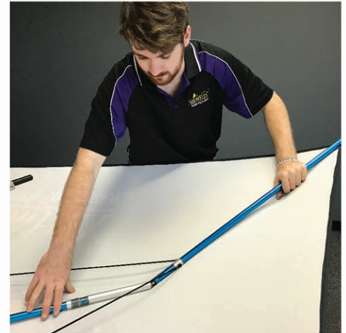
Unfolding last arm stretches fabric tight