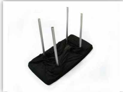
6. Cover the black skirt or graphic on the bottom