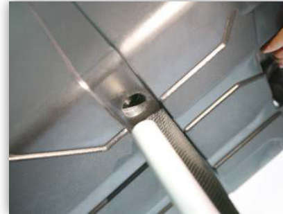
7. Connect the top and poles