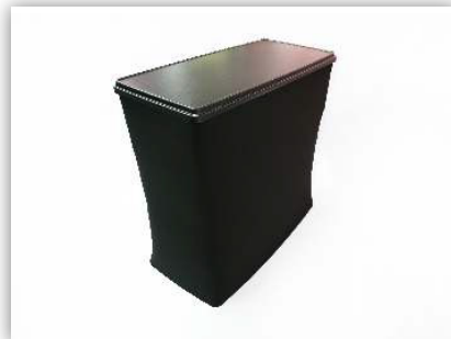
10. Place countertop on display

*** Please Note: Fastening the poles into the base incorrectly may result in damage to the unit