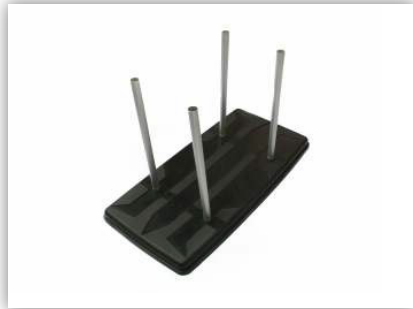
5. Secure all 4 poles