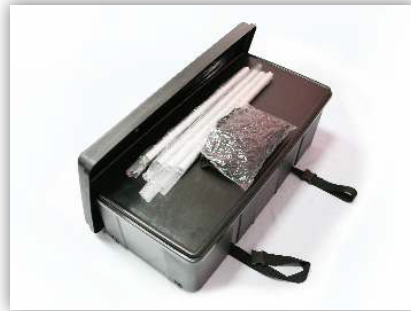
2. Release fasteners