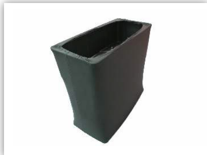
9. Pull the black skirt or graphic up