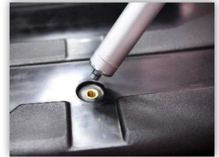
4. Screw the poles into the case