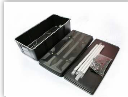
3. Get all parts out