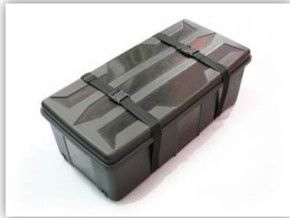
1. Hardcase with wheels and handle