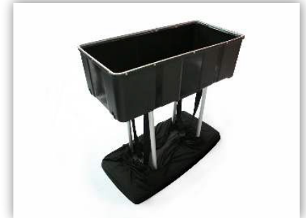
8. Place top on poles