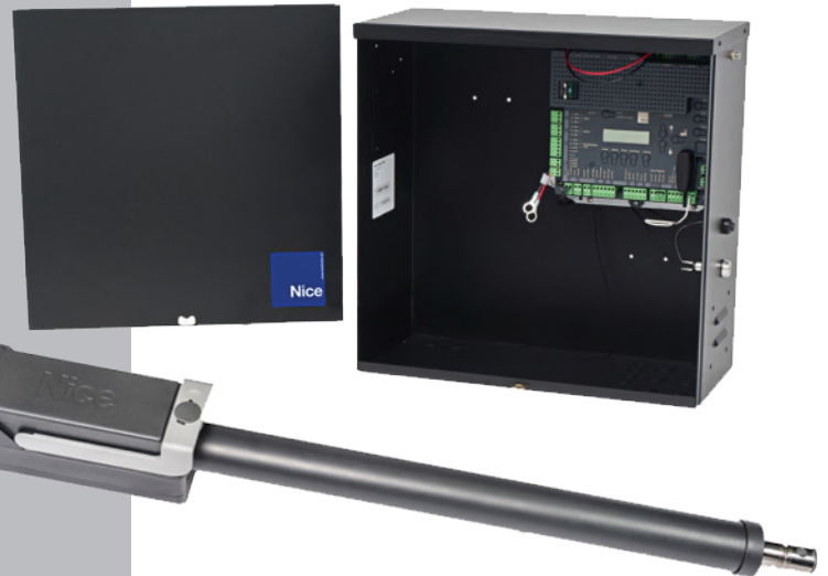
TITAN12L1 : 1050 Board, CBOX, 912L actuator

* Battery required for operation, not included