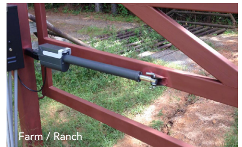
Farm / Ranch