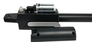
Easily replaceable field service modules

* Actual UPS cycles depend on accessory power draw, frequency of cycles, battery health, ambient temperature and other conditions.