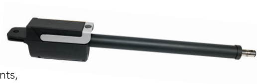
Swing Gate Operator

VISIT WWW.HYSECURITY.COM for installation manuals, parts diagrams, wiring diagrams, specifications, image gallery, videos, training and much more.