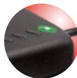
LED power indicator