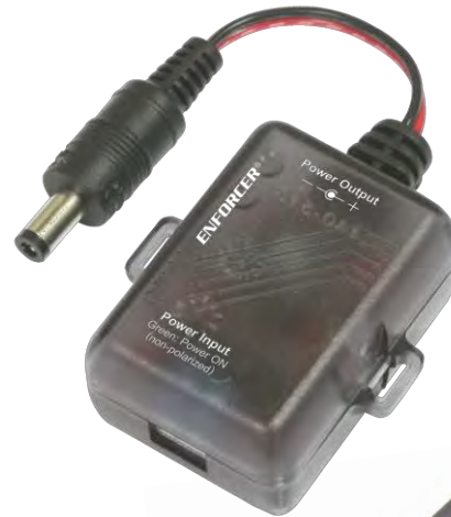
ST-LA108-TPQ / ST-LA115-TPQ