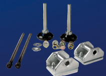
JAMB TRACK HARDWARE