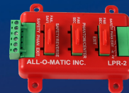
PRE-WIRED LOOP RACK