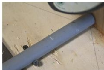
1/2" Schedule 40 Rigid PVC Conduit after the first drop.

I would like to emphasize the loop itself should never be run through conduit. Having an air pocket within the loop would allow room for the wires/loop windings to move within the conduit resulting in false detections or detector lockup. These false detections will cause the gate to open by itself and result in a repeat service call for a problem that is very hard to diagnose. There are several articles, tests, and videos about the dangers of air pockets that can be viewed on the BDLoops.com website.