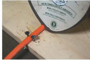
XLPE Preformed Loop Wire