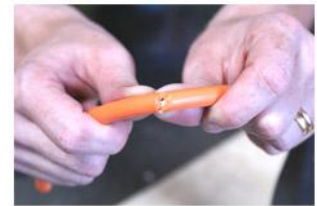
XLPE Preformed Loop Wire

The result of our testing shows that the loop lead-in should always be run through conduit because PVC conduit adds more protection to the loop than a loop's jacket and insulation alone. Running the loop lead-in through conduit and properly sealing the joint is an inexpensive way to add a lot of protection to the loop installation. Regardless of which loop or preformed loop is being used the lead-in run should be run through conduit for the added protection.