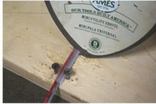
BD Loops Preformed Saw-Cut Loop Wire