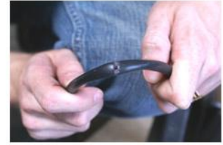
BD Loops Preformed Direct Burial Lead-In Wire