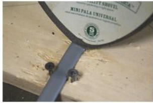
BD Loops Preformed Direct Burial Loop Wire