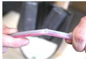
BD Loops Preformed Saw-Cut Loop Wire