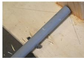
1/2" Schedule 40 Rigid PVC Conduit after the third drop.