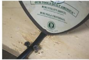
BD Loops Preformed Direct Burial Lead-In Wire