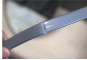
BD Loops Preformed Direct Burial Loop Wire