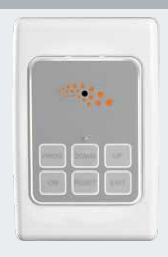
CT-A1 Indoor Sounder