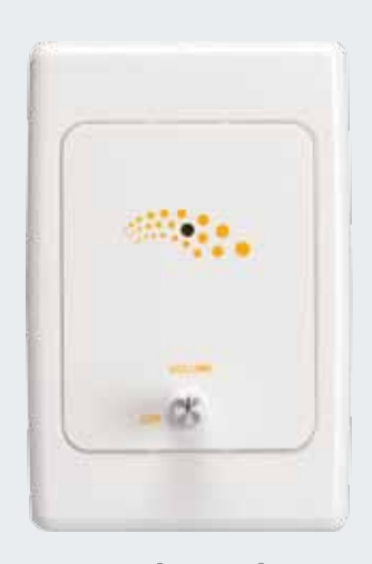
AA-1 Alarm Alert