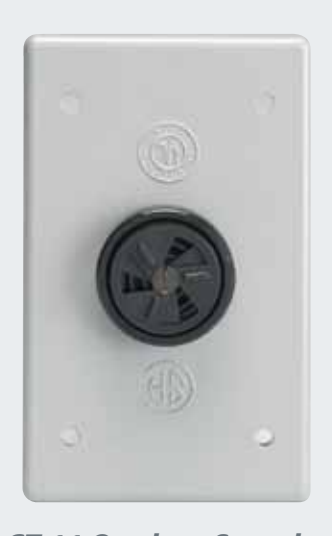
CT-11 Outdoor Sounder