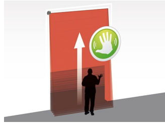
Virtual Push Plate