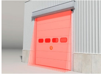
Automatic Industrial Doors