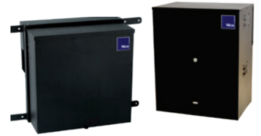
Slide Gate Operator

Nice Group USA is a U.S. leader in low voltage automated gate systems, with solar power options. We offer a wide range of automation systems for swing gates, sliding gates and road barriers for residential, commercial and industrial applications.