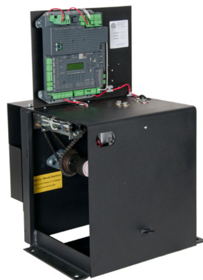
7351: 1050US Board, pad mount