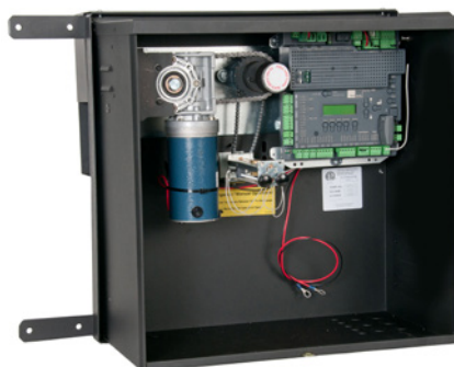
7251: 1050US Board, post mount

* Battery required for operation, not included