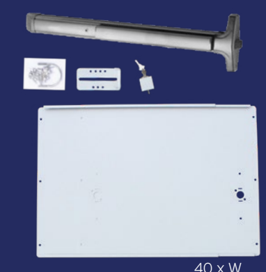
40 x W