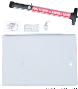
V40 x EB x W