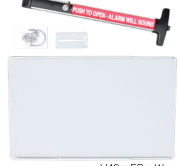
V40 x EB x W