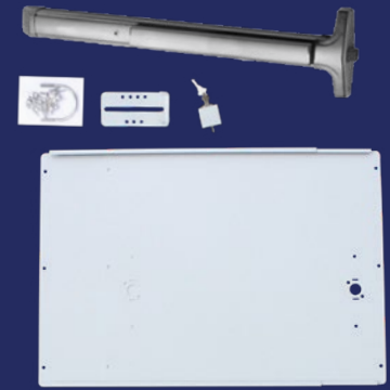
40 x W

* 2", 3", 4" round or square u-bolts available for all kits upon request