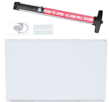
V40 x EB x W