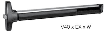
V40 x EX x W