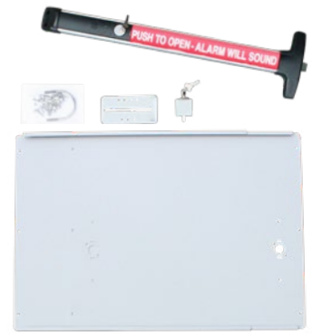
V40 x EB x W