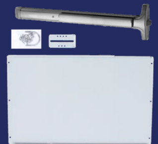
40 x W