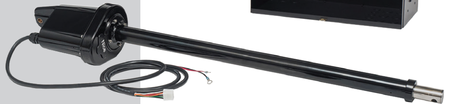
1551: 1050 Board, CBOX, 816 actuator

* Battery required for operation, not included