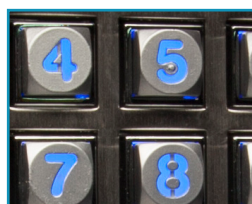
lighted keys for easy night time operation