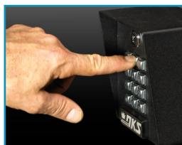
keypad users enter 4-5 digit unique PIN to gain entry