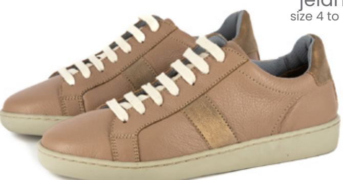
var 002 timber cayak & beige spirit Soft goat leather & metallic goat leather