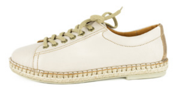
var 036 cream cayak Soft goat leather

var 030 leopard lisoto Goat leather with animal print