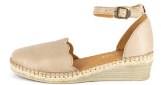
var 006 gravel vintage Soft milled cow leather