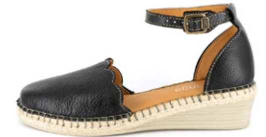
var 009 black cayak Soft goat leather