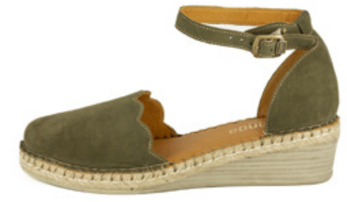
var 030 bilbao velutto olive Soft cow suede