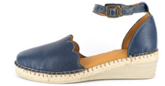
var 010 denim cayak Soft goat leather