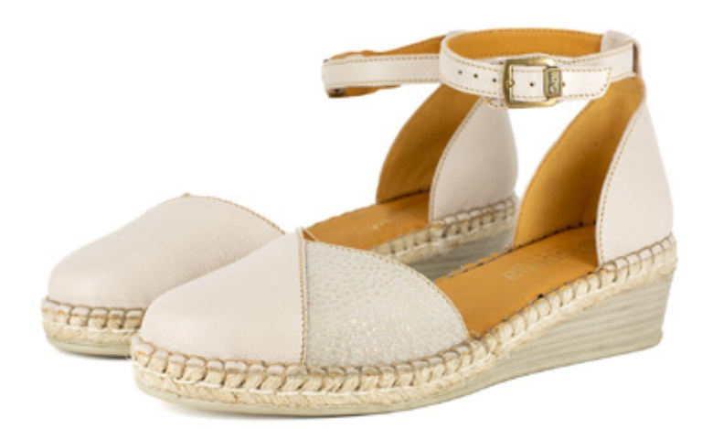
var 001 cream cayak & stone brillo Soft goat leather & goat leather with animal print