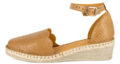
var 023 walnut coco lux Soft goat leather with animal print