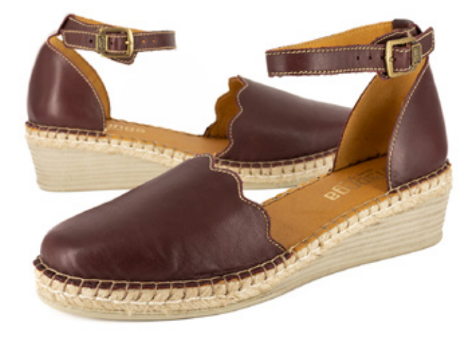
var 029 raisin relaxa Soft cow calf leather