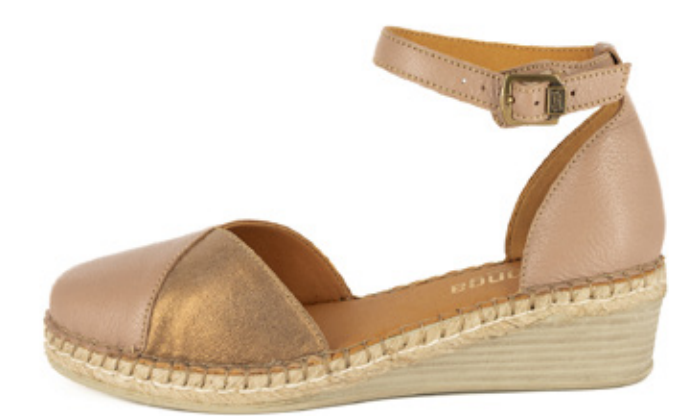
var 007 timber cayak & beige spirit Soft goat leather & metallic goat leather