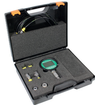
Pressure Test Kit (Digital) Type SMB-DIGI