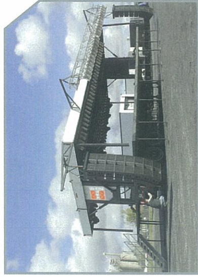
Dynastage model 40 30 20 can handle a full complement of sound and lighting equipment.