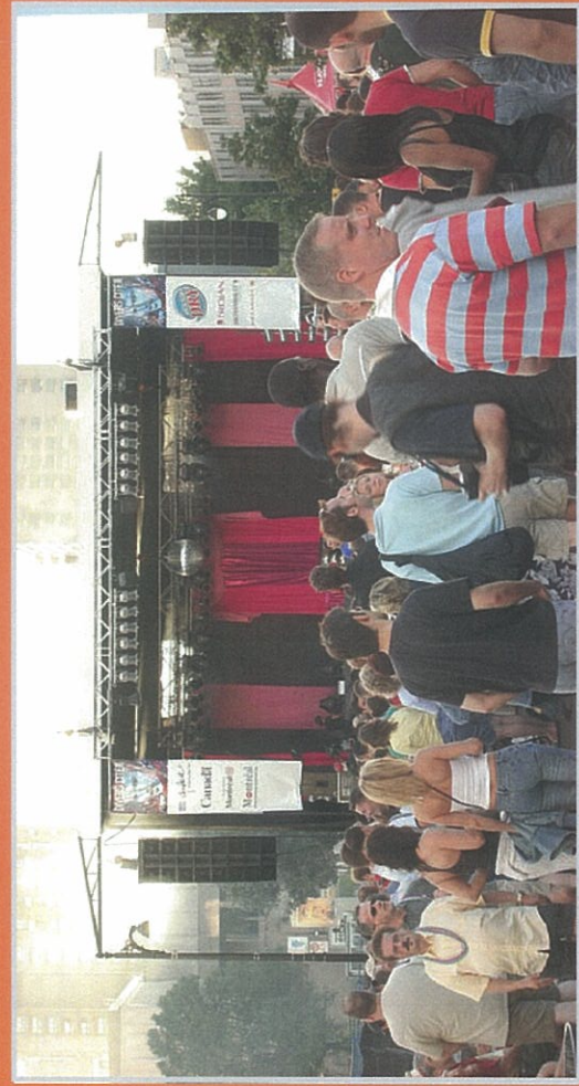
Dynastage model 40 30 20 in downtown Montreal during the annual Divers/Cité festival