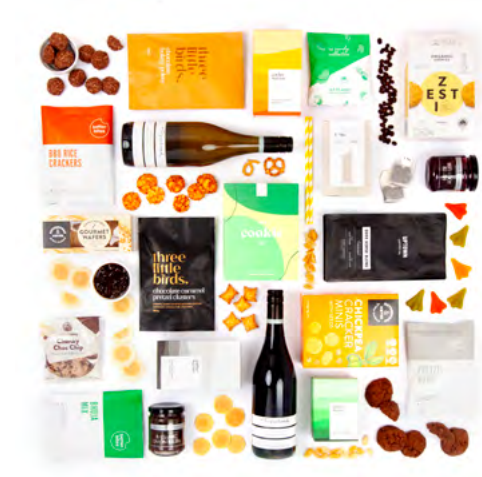
THE ULTIMATE INDULGENCE $200