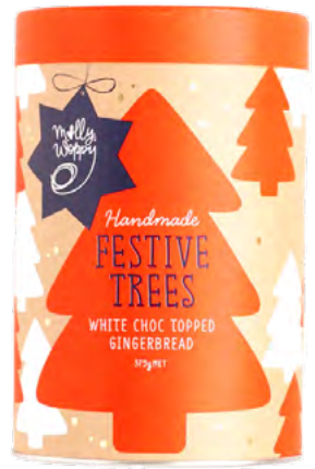
MOLLY WOPPY FESTIVE TREES CYLINDER $35