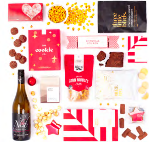
THE JINGLE BELLS $100