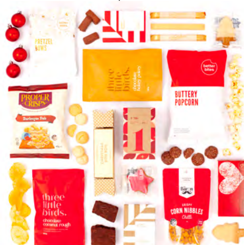
THE SANTA'S SLEIGH $100