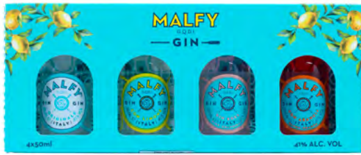
MALFY MINI GIFT PACK $35