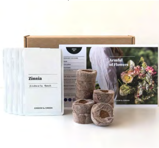
GIBSON & GREEN GROW KIT $40