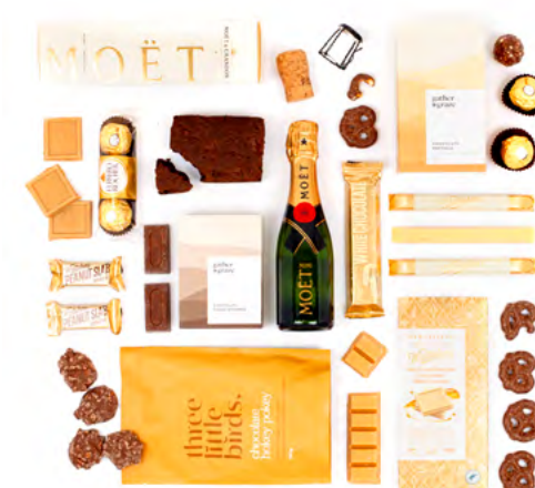
THE CHOCOLATE LOVER $90