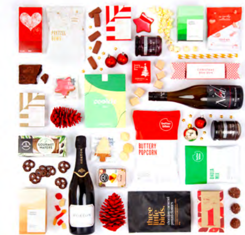
THE VERY MERRY CHRISTMAS $200