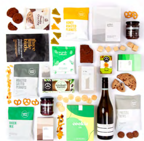
THE BIT OF EVERYTHING $150