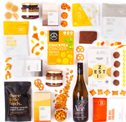
THE ENTERTAINER $145