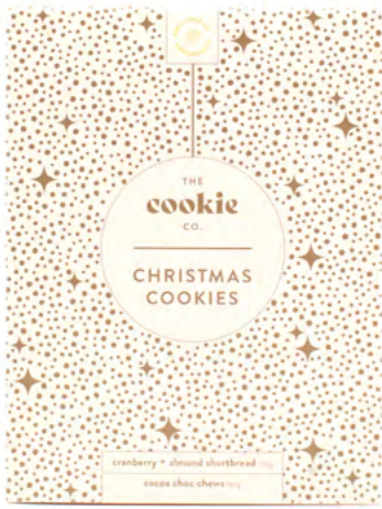
THE COOKIE CO TWIN SET $16