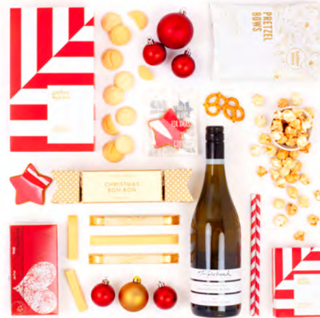
THE FESTIVE FEELS $80