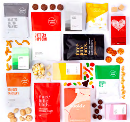
THE SWEET TREATS AND SAVOURY EATS $110