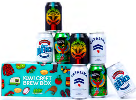
KIWI CRAFT BREW BOX PACK $40