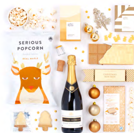
THE WHITE CHRISTMAS $90