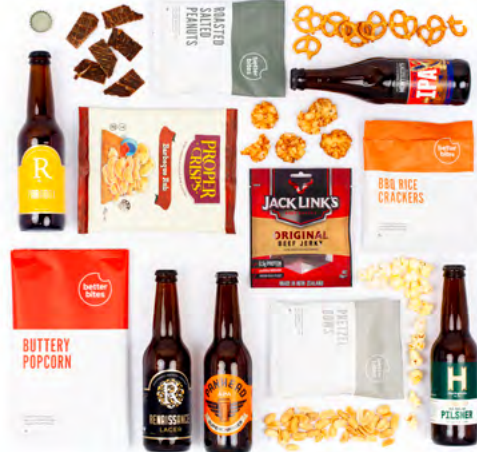
THE CRAFT BEER LOVER $70