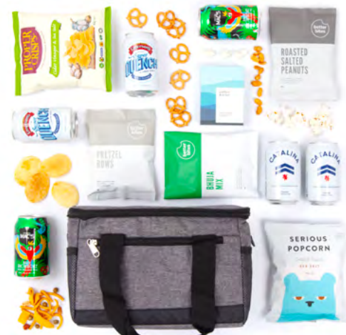
THE CRAFTY COOLER $85