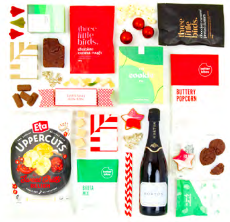
THE MERRY CHRISTMAS $130