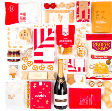
THE CHRISTMAS CHEER $150