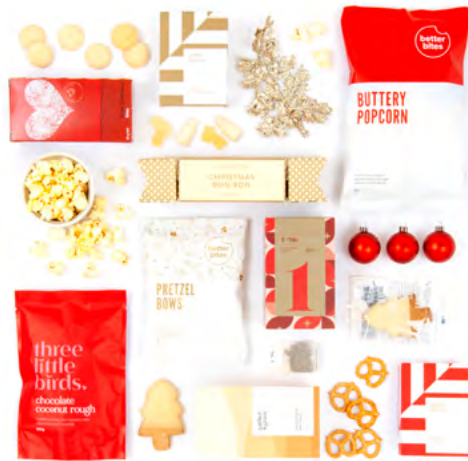
THE SEASONS GREETINGS $65