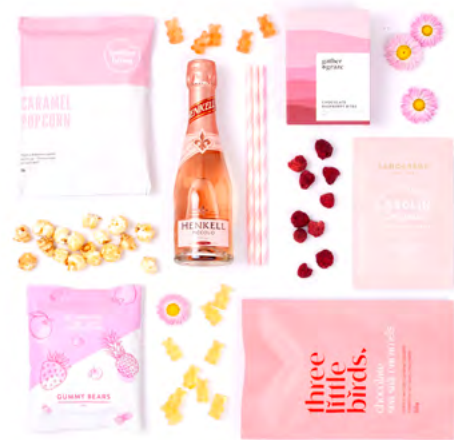
THE SHE'S SO SWEET $50