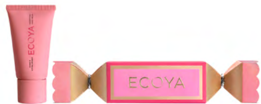
ECOYA HAND CREAM BON BON $19.95