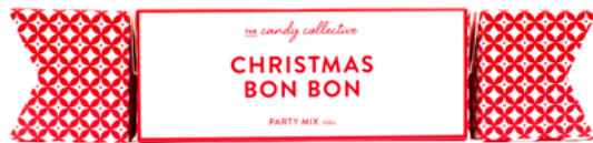
THE CANDY CO BON BON $7.50