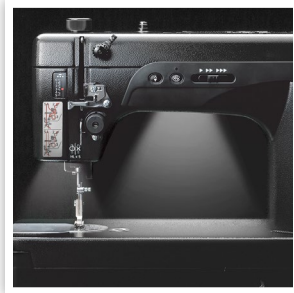
BRIGHT LED LIGHTING, TWO LOCATIONS