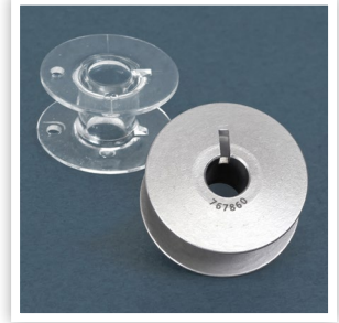
HIGHER CAPACITY BOBBIN (1.4X LARGER)