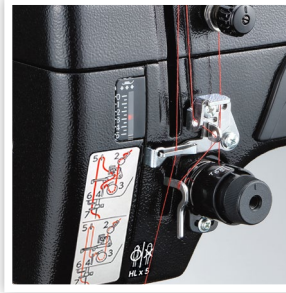
ADJUSTABLE THREAD GUIDE