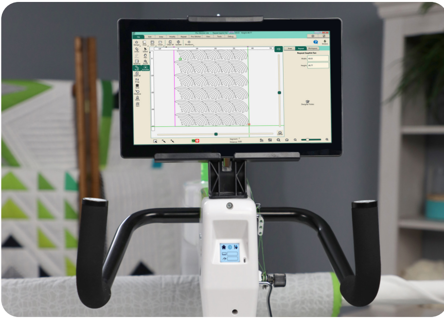
Pro-Stitcher Lite shown on one of many compatible machines.