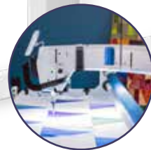
Easily upgradeable to a frame mounted machine