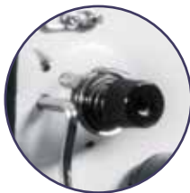
Easy-Set Tension TM