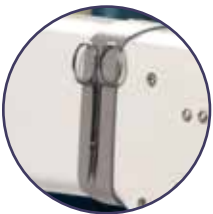
Magnetic tool minder collar