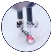
Pinpoint needle laser